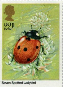
Seven Spotted Ladybird