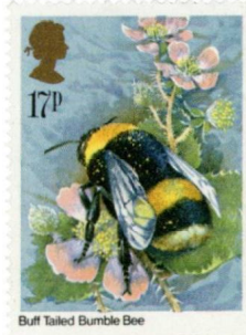
Buff Tailed Bumble Bee