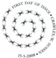
Talents House (FD0811) and Crawley (FD0812) postmarks.